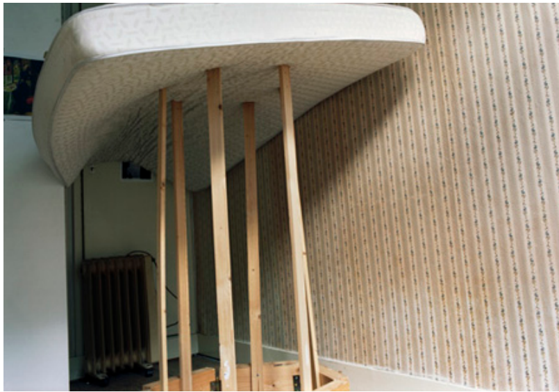
'The Landing #4', 2007 100 x 120 cm Photograph